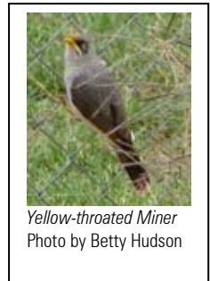
Yellow-throated Miner