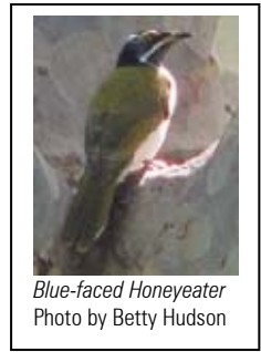
Blue-faced Honeyeater