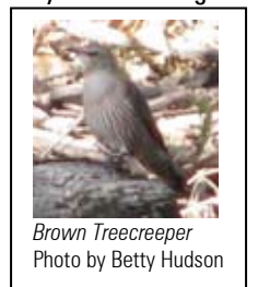
Brown Treecreeper

Mum was keen to check out this place with its listed variety of birds and wetlands along Bundidjarie Creek. We were hoping to see the Dollar bird but I think it might have been the wrong time of year. It was a beautiful spot, tucked away down a long and winding dirt road with very little traffic. We had barely got out of the car when we saw birds everywhere! Several Brown Treecreepers foraged on the ground all around us as we ate our lunch. We also saw Fairy Martins, Welcome Swallows, White-plumed Honeyeaters, numerous Little Friarbirds, a Darter drying its wings on a dead log, a Little Pied Cormorant fishing and both the Pacific Black Duck and the Wood Duck. One of the highlights here was seeing two Whistling Kites chasing away a single Wedge-tailed Eagle. It was so interesting to see them together and to realise just how much bigger the Wedgie is. Measurements in the field guide really don't give you the same idea as to size. It was peaceful and relaxing and a lovely way to end a very enjoyable week away.